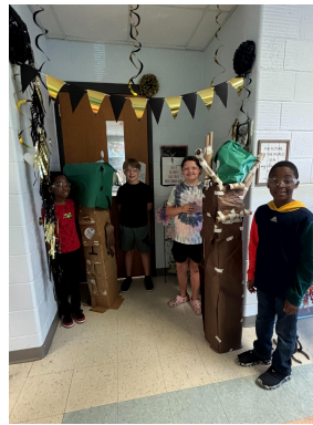
These trees are a 'work in progress'.