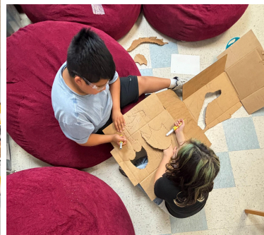
5th grade GT students showing their tools and working together