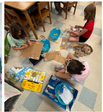
These are three different mini projects coming together.