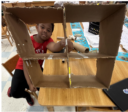
He has discovered that supports need to be added so the bookshelf will stand.